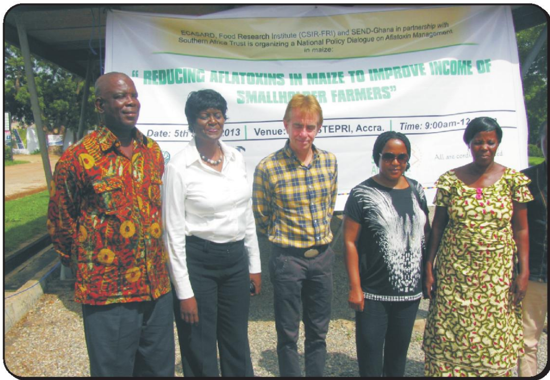
Some participants at national policy dialogue on Aflatoxins