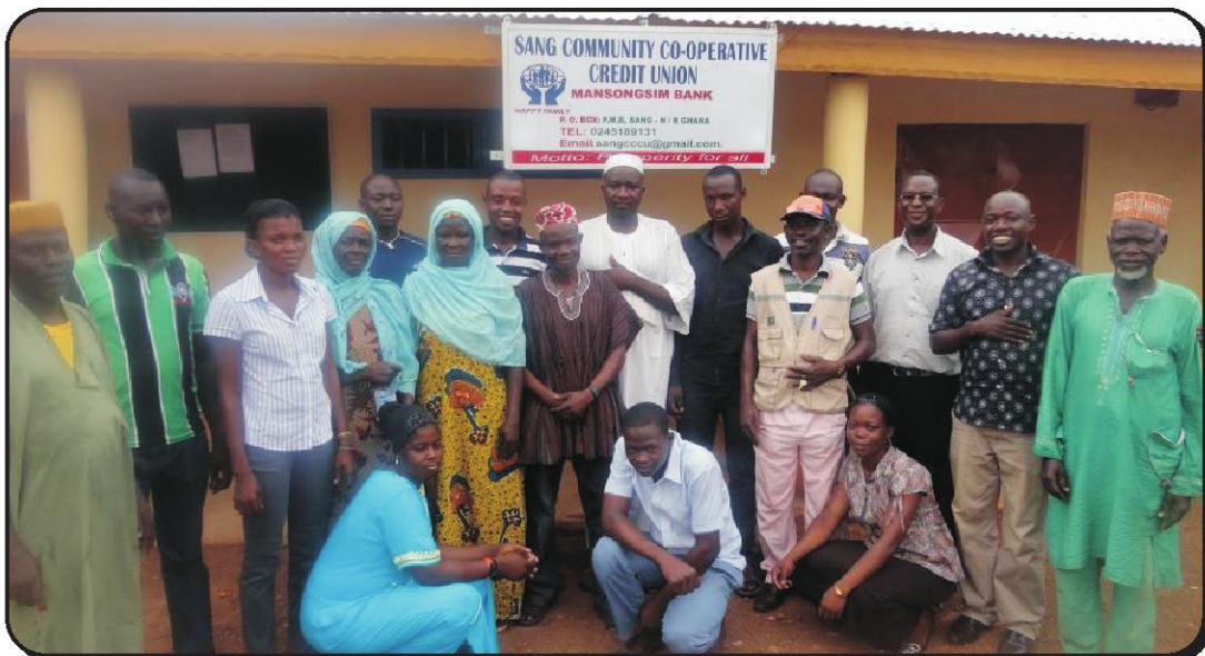
Interim Board and Committee members of the newly established Sang Community Co-operative Credit Union at Sang