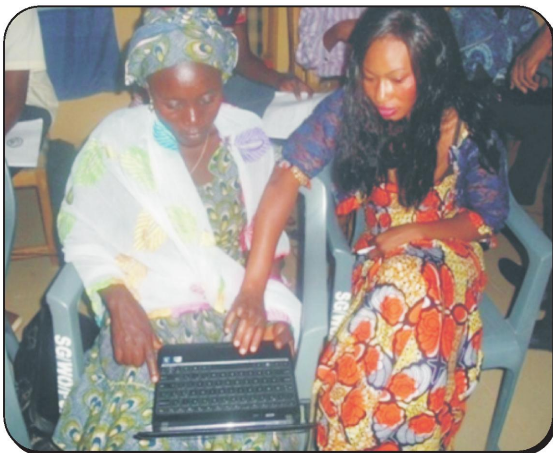
Members of DCMCs learning to use ICT for data gathering

SEND-GHANA research on maternal health reveals that between 2009 and 2012, Ejura, Kpandai and East Mamprusi did not receive budgetary allocations from Ghana Health Service. Subum received funds but only in 2012. This is impeding quality health delivery. 2. SEND-GHANA research on maternal health observed that lack of critical equipment and logistics such as ultra sound scanners, delivery beds, weighing scales, pressure machine (Sypgb), among others impact negatively on emergency delivery