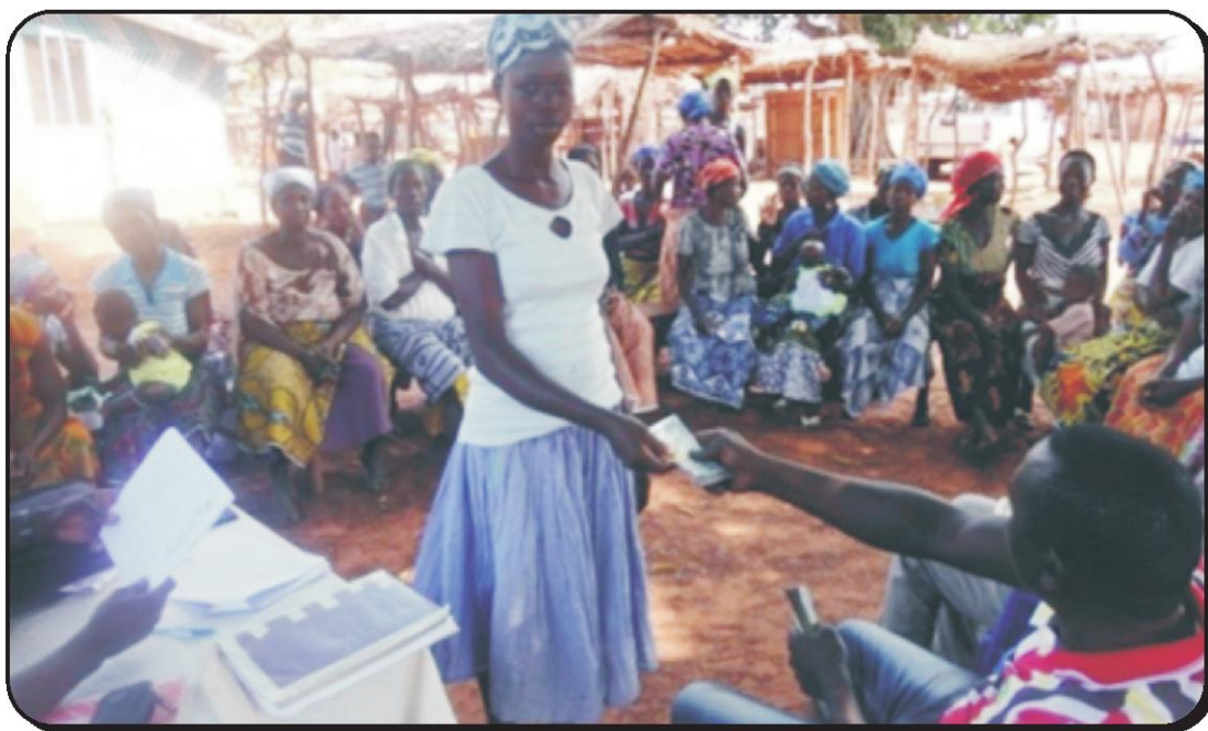
Micro finance Clients in Taali, Nananumba North District