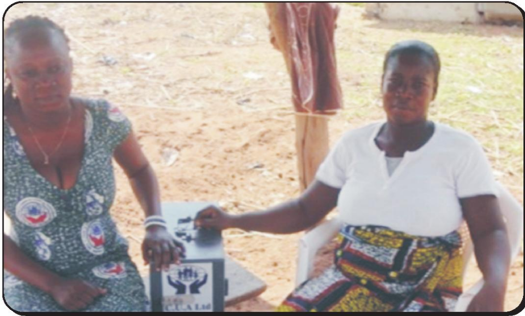
A beneficiary of micro finance with her new saving box

programme. Chereponi and Tatale have submitted their applications and are due to receive their codes in the first quarter of 2014.