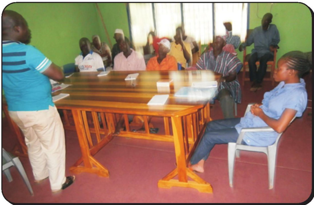
Salaga Zonal Co-operative Leaders meeting in their new Office