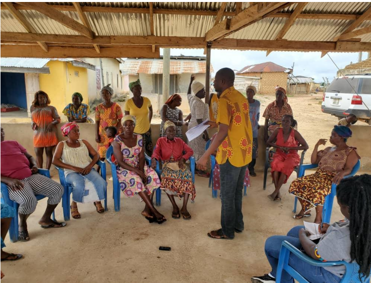
Picture 3: A Focus Group Discussion with some women cocoa farmers in the central region of Ghana