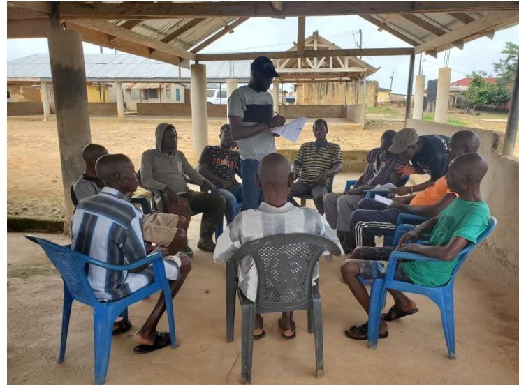
Picture 2: A Focus Group Discussion with men cocoa farmers in the central region of Ghana