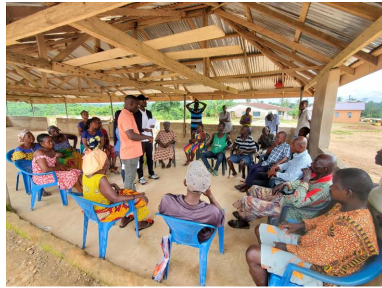
Picture 4: A Focus Group Discussion with a mixed group in the central region of Ghana