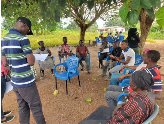
Picture 5: A Focus Group Discussion with some youth in in the eastern region of Ghana