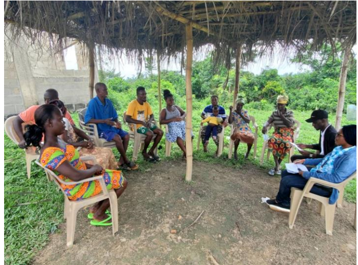
Picture 6: A Focus Group Discussion with a mixed group in the eastern region