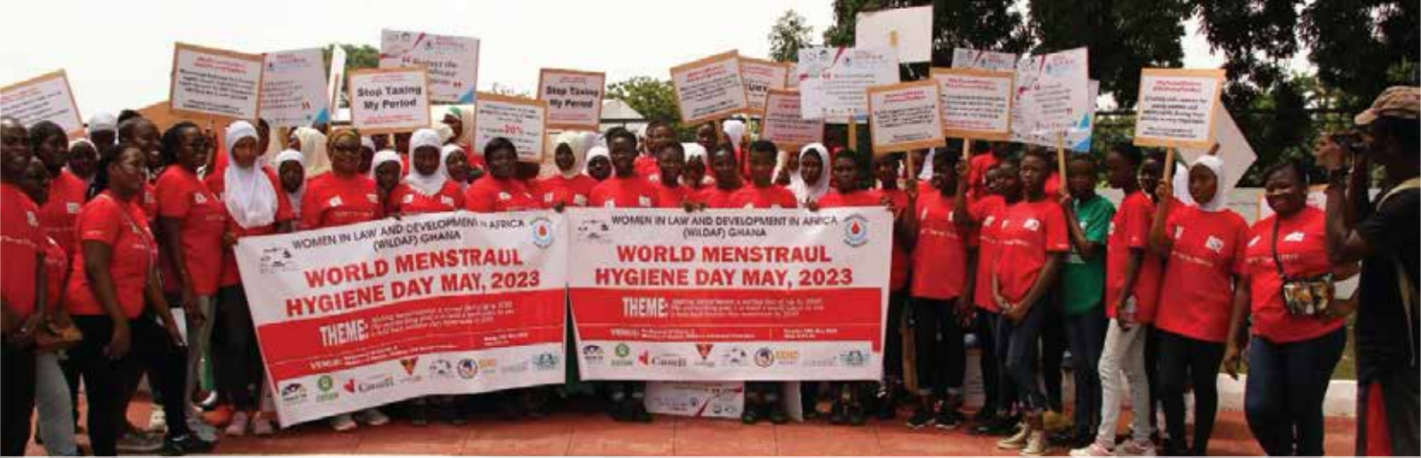
Civil society and adolescent youth groups in a group photo taken during the protest on the placement of tax on sanitary products in Accra, Ghana.