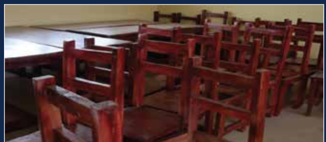
Finished Classroom fitted with chairs