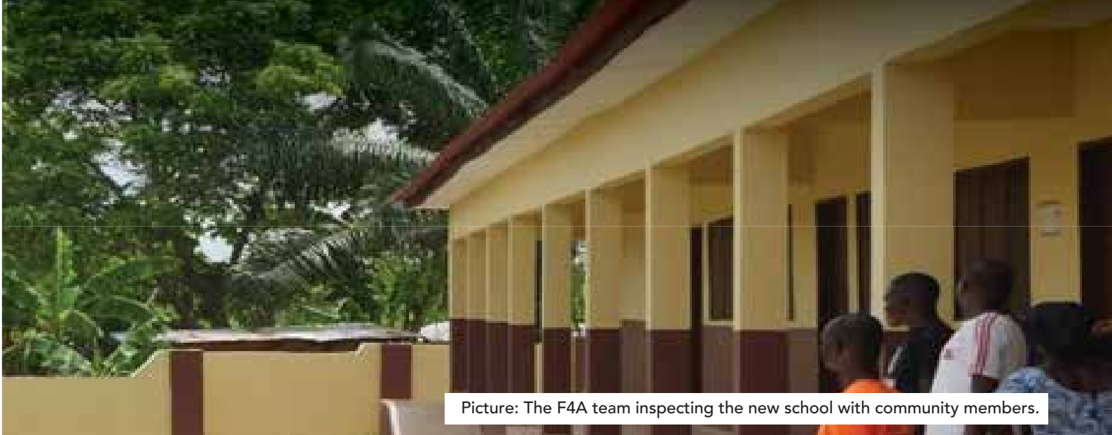
Picture: The F4A team inspecting the new school with community members.