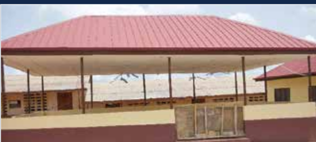
Picture: The cafeteria section of the new school.

The community members are eagerly anticipating the commissioning of the new edifice in the coming months, hoping it will enhance learning outcomes for the numerous children attending school in the community. "We are grateful to the Fair4 All project for providing the platform for this remarkable transformation. This structure will significantly reduce the number of students cramped up in small classrooms and enhance learning with the added amenities such as the computer lab," he concluded